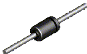
DO-41 COLOR BAND DENOTES CATHODE